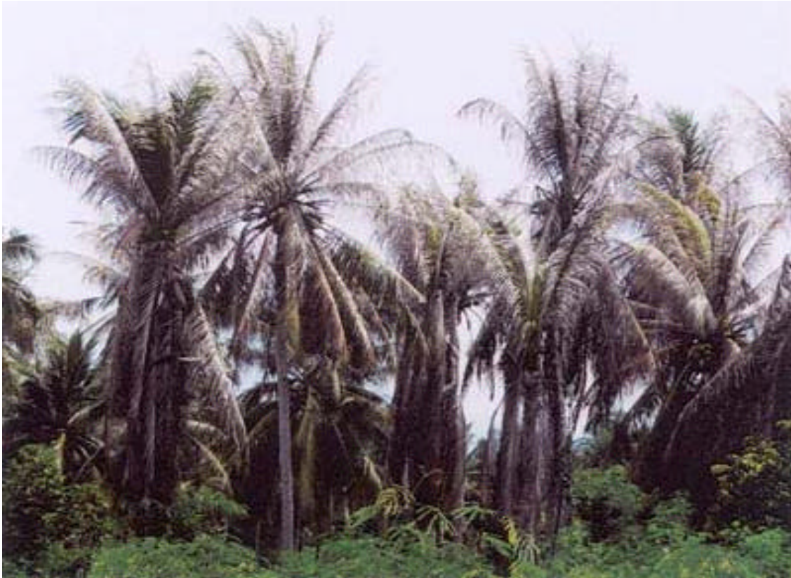
Fig. 2. Brontispa longissima damaged coconut plants in southern Thailand.