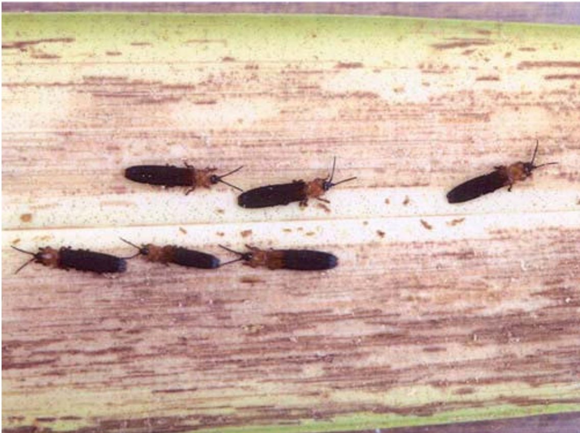
Fig. 1. Adults of B. longissima show on young coconut leaf.

will lead to death of the tree (Fig. 2). Seventeen species of palm trees including oil palm, nipa palm and many ornamentals can be attacked. The beetle is believed to be endemic to an area which includes Indonesia and Papua New Guinea and was accidentally introduced into several other countries in the Pacific in the 20th century. However, the pest was not reported from continental Southeast Asian countries until the late 1990's when it was found in the Mekong Delta of Vietnam (Fig. 3). Around the same time, the pest was introduced into the Maldives. It is suspected that this pest was accidentally introduced into both countries with a shipment of ornamentals. The pest has been expanding in areas around Southeast Asian countries, and it was found in Myanmar in 2004, followed by the Philippines in 2005. The pest seemingly continues to spread further westward, and thus the region of South Asia, including India, Sri Lanka and Bangladesh, is at great risk of invasion. Since there are a large number of coconut industries in these countries, the pest incursion would be catastrophic.