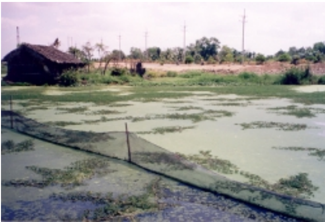
Figure 4. Water mimosa system in Binh Chanh district

This type of system is usually found in two main areas in HCMC, Binh Chanh district and District 12 where the water quality is found suitable for water mimosa to grow well.