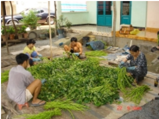
Figure 1. People are involved intensively in morning glory pre-processing

Although the city's Authority has assigned some regions of the city to be reserved for agriculture/aquaculture development, aquaculture areas in many other places within the city are being developed into residential zones and for public construction projects. Land use priority is rarely given for aquaculture purposes when it needs to be considered. Therefore area depletion is another pressure on aquaculture activities and thus to fish and aquatic plants growers of the city.