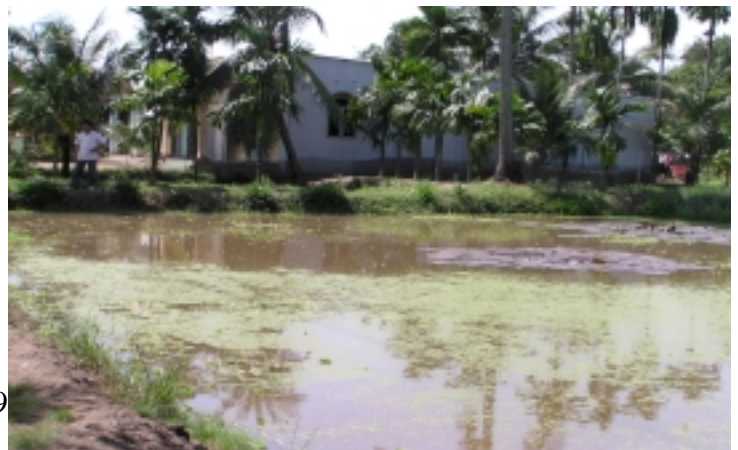
Figure 2. Fish culture pond in Da Phuoc commune - Binh Chanh district

Many fish species with different feeding behaviour are stocked in a pond to feed on natural foods at all different layers of the pond water column. This system maximizes the natural food utilization in the culture system and therefore supplemental feeds are used very sparingly. The most commonly cultured fish species in this system are tilapia, common carp, grass carp, silver carp, pangasius, and catfish, in which tilapia is the most preferred species. This fish poly-culture system can be seen and is very popular in either wastewater-fed areas (Da Phuoc, Phong Phu commune, Binh Chanh district) or non-wastewater areas (Long Thanh My ward, District 9; Dong Thanh commune, Hoc Mon district). While wastewater is used as nutrient source for natural foods development in wastewater-fed ponds, the main nutrient input for fish polyculture pond are animal manures which originate from household integrated livestock systems eg pigs, ducks, or from collection. Farmers carry out different species composition and stocking density within their ponds based on their own knowledge and experience. Therefore the utilization efficiency of natural foods is varied amongst different farmers' ponds. As a result profit from fish culture varies between the different households involved depending on their level of experience and expertise.