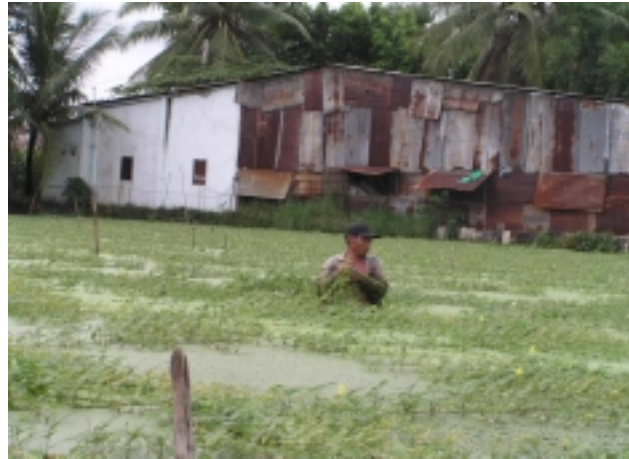
Figure 5. Water mimosa system in District 12

This type of system can also be seen concentrated in one place in Thanh Xuan ward, District 12. The distinctions between water mimosa in this place and in Binh Chanh district are many but can be generalized as two main points 1/ water quality in Thanh Xuan commune is better than in Binh Chanh district 2/ most farmers here are not local villagers, they have recently migrated from other provinces, especially from the North. Migration of people into the area for water mimosa culture indicates that this is an attractive and lucrative source of income, at least for people who face livelihood difficulties and have to leave their original homes.