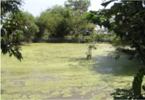
Figure 3. Fish culture pond in Dong Thanh commune – Hoc Mon district

With a higher stocking density, this model can be considered as a more intensive system, in which supplemental feed is required as natural foods are not able to supply the total nutrient requirement of the fish. High value fish species such as red tilapia, hybrid catfish, giant gourami, etc. are cultured in these systems using manufactured pelleted feeds. Tilapia and red tilapia are the most commonly cultured species in Phong Phu, DA Phuoc commune, Binh Chanh district; Long Thanh and My ward, District 9. Catfish are also used for mono-culture systems in some households in Da Phuoc commune, Binh