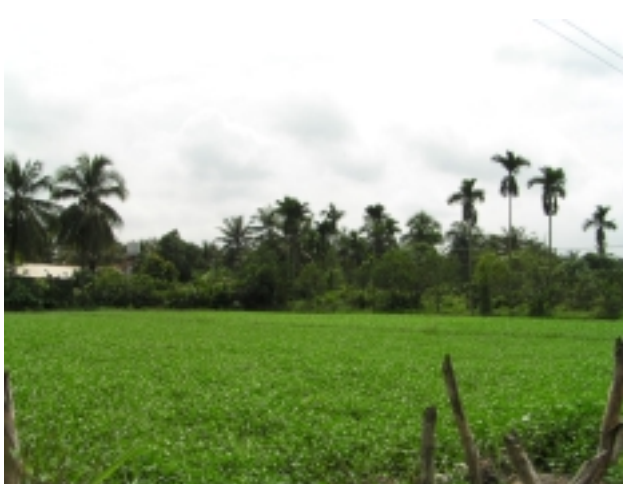
Figure 6. Morning glory system in Tam Phu commune, Thu Duc district

Morning glory is found to be another suitable species for the wastewater environment which also provides a good income source for farmers. Tam Phu commune in Thu Duc district is the most common and concentrated place for this production. In this commune there are many lowland fields which experience high acidity and polluted wastewater, which cannot be used either for rice or fish culture. Morning glory is therefore cultivated as the only appropriate crop. Therefore